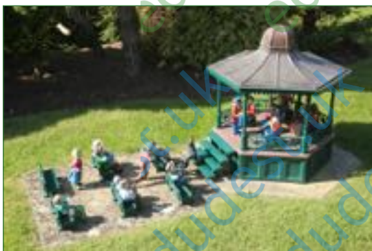
Listen to the band in the park