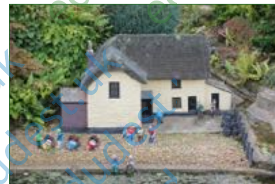
Visit Shanklin Chine, have tea at Fisherman's Cottage; play on the beach