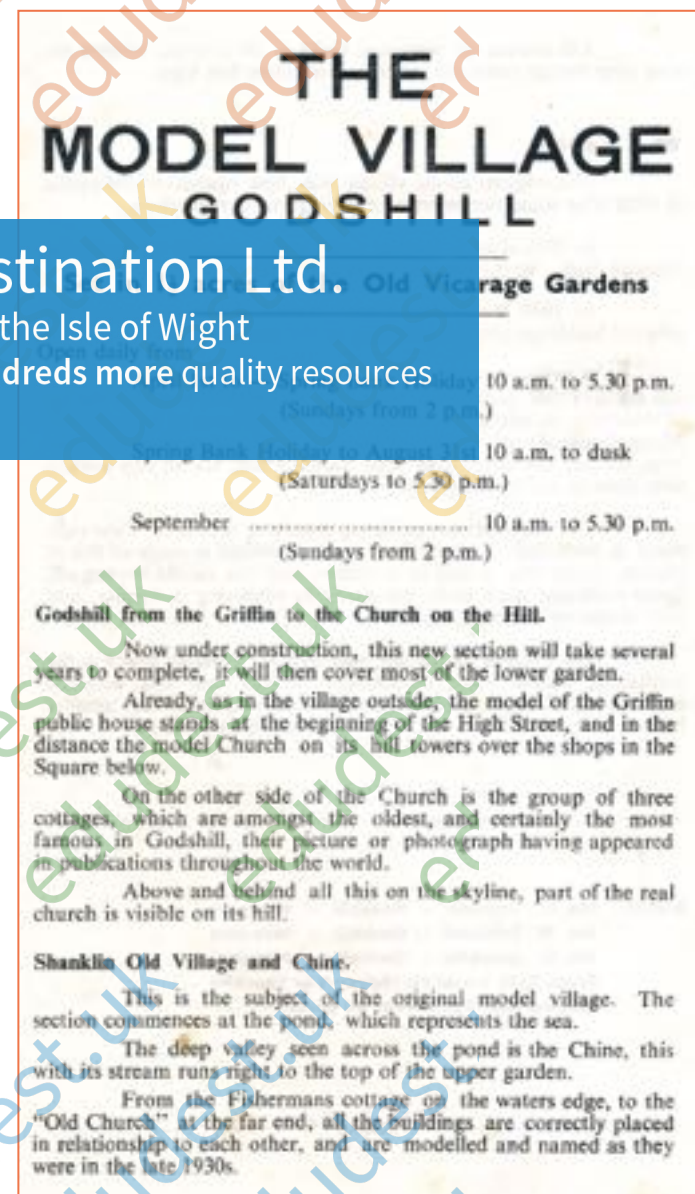
Facts about the 1930s aspects seen at the Model Village, includes Shanklin Old Village/Chine