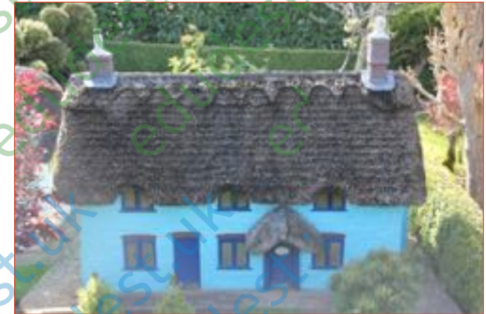
Rent Myrtle Cottage