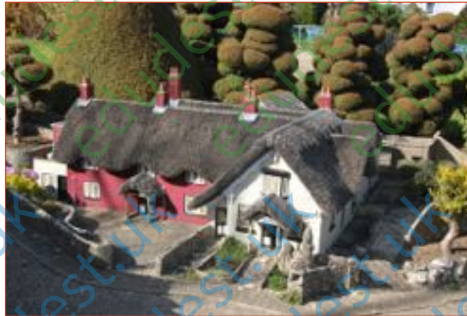
Stay at the Crab Inn