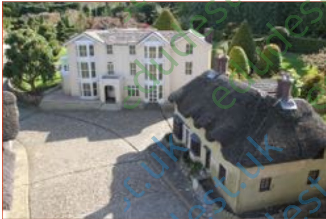
Stay in Holliers Hotel