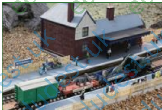
Travel around the Island by train