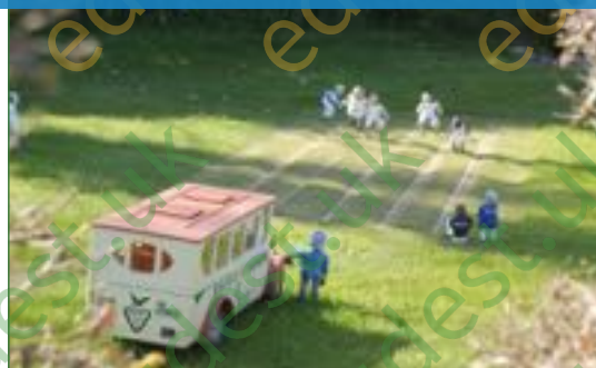
Buy an ice cream