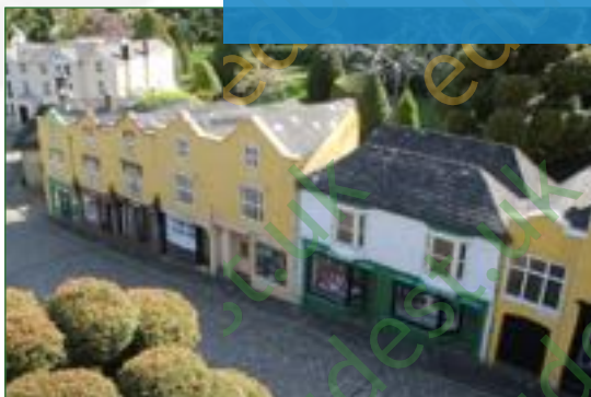
Shopping in the Old Village