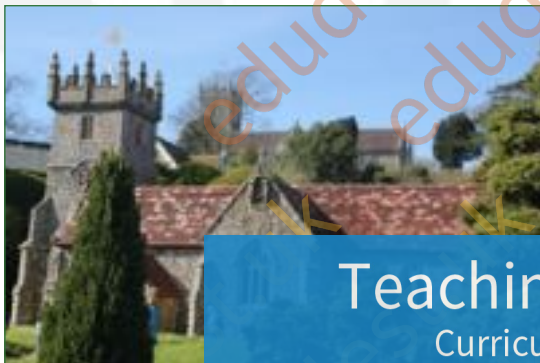
Visit Godshill Church